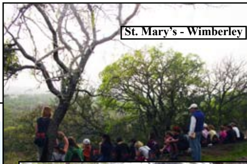
St. Mary's - Wimberley