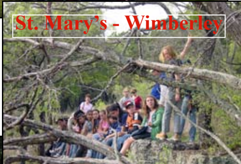
St. Mary's - Wimberley