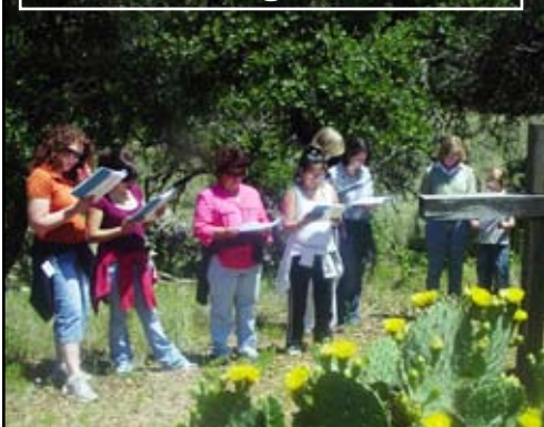
Mother Daughter Retreat