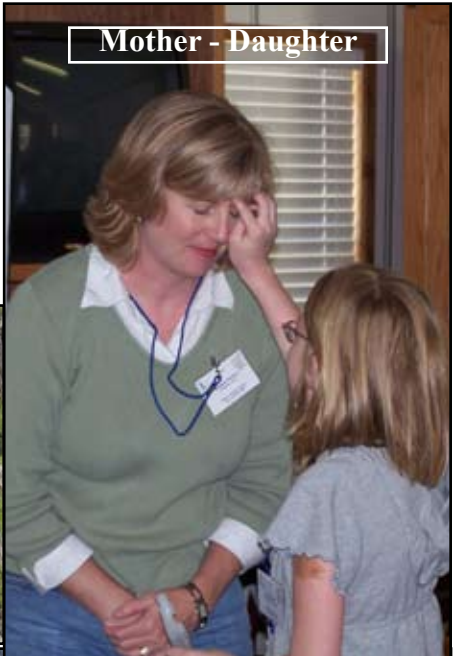
Mother - Daughter