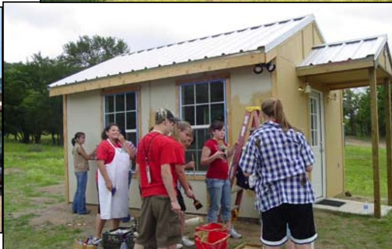
Painting the adoration chapel was one of the service projects performed during Godstock.