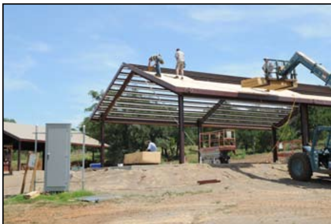
Construction on two dorms.