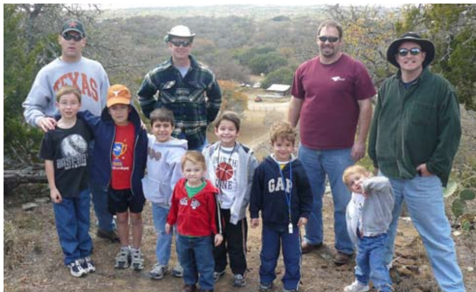
St. Thomas More Father-Son Group