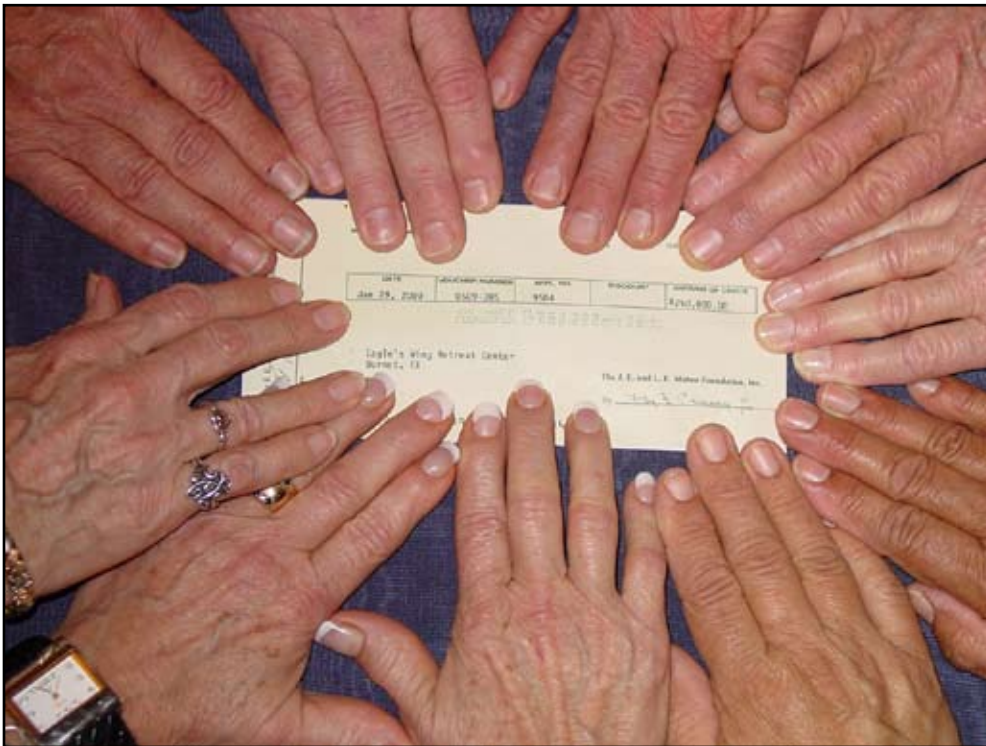
Many hands were involved in achieving the Mabee Challenge Grant

years to enable Eagle's Wings Phase II construction to take place. We truly do have an awesome God. The Body of Christ can make the impossible become possible with many hands helping. Hands that have labored in preparing mail-outs, digging and clearing land, preparing building sites, fundraising events, working cap-