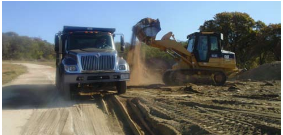
Funke Const. doing site prep.