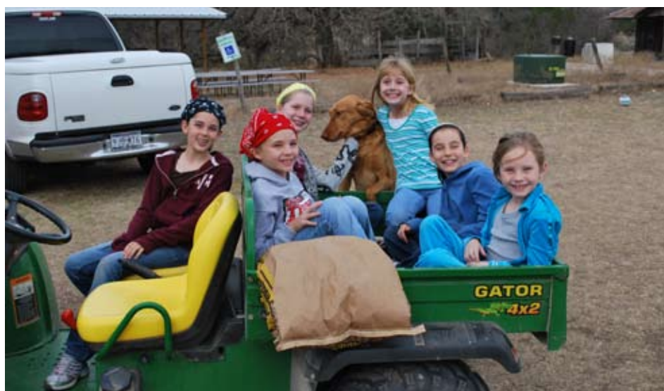
Temple Girls at the father - daughter retreat