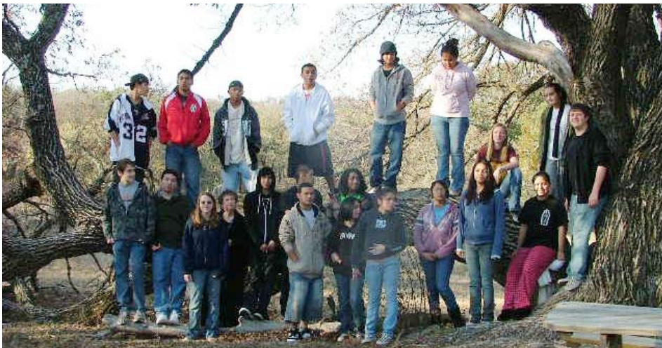
St. Mary's of Wimberly & Immaculate Heart of Mary in Martindale