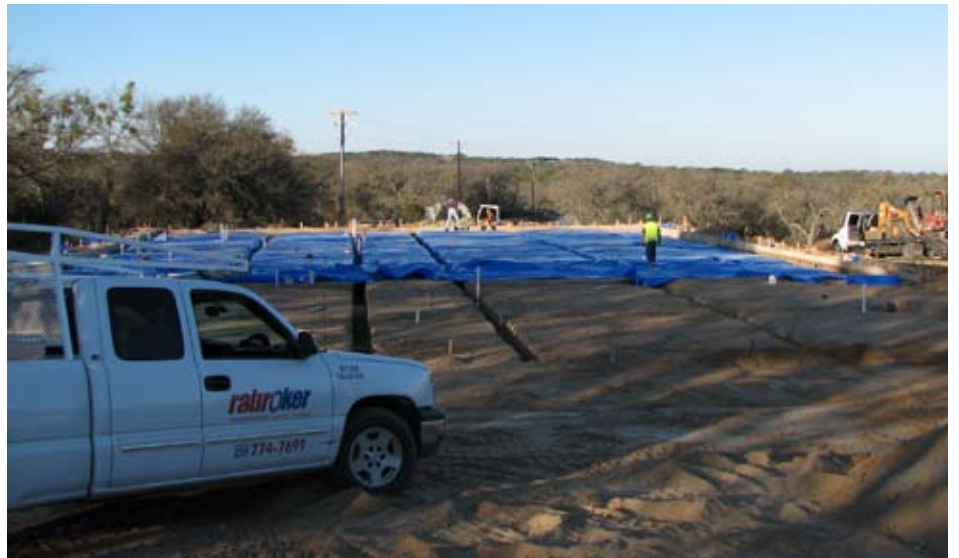
Rabroker completing plumbing roughin on dining hall